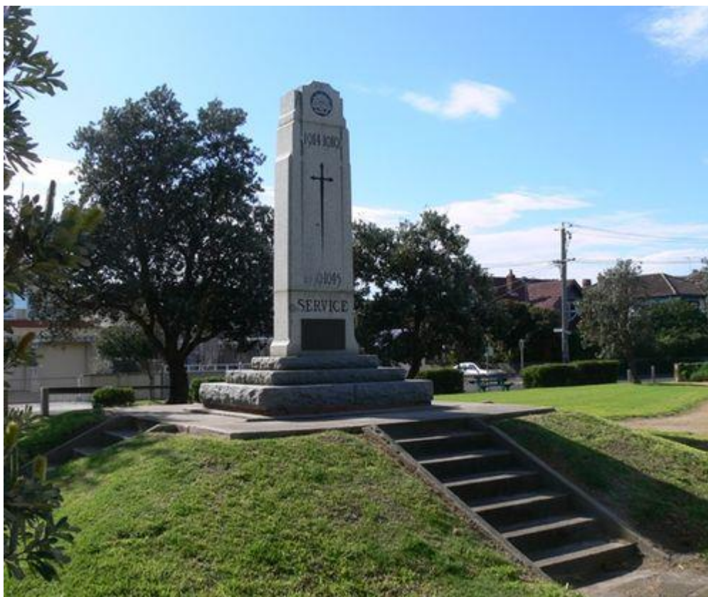
Sandringham Cenotaph

The Sandringham Cenotaph, located at The Crescent, Beach Road, Sandringham, Victoria does not list individual names.