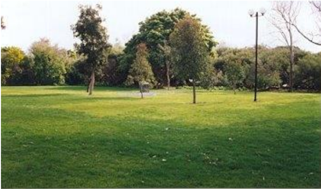
Sandringham Avenues of Honour